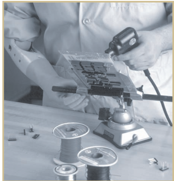
FIGURE 4 —Using purposeful activity in therapy focuses attention on a meaningful goal rather than on the process required for achievement.