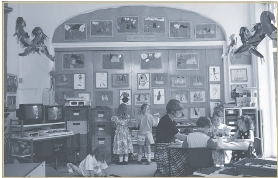
FIGURE 10 —A day care center for disabled children is a type of community center that employs occupational therapy workers.