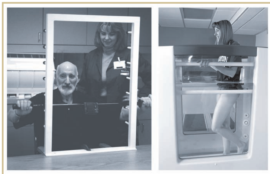
FIGURE 7 —The occupational and physical therapy departments are essential service units in rehabilitation hospitals.

Physicians are increasingly referring patients with certain conditions to rehabilitation hospitals . These facilities provide short-term care for individuals who need around-the-clock nursing care and intensive therapy following a stroke, certain surgeries, disease, or serious injury. Because patients are sent to rehabilitation hospitals to receive intensive therapy, the occupational therapy and physical therapy departments are essential units of the health care team at these facilities (Figure 7).