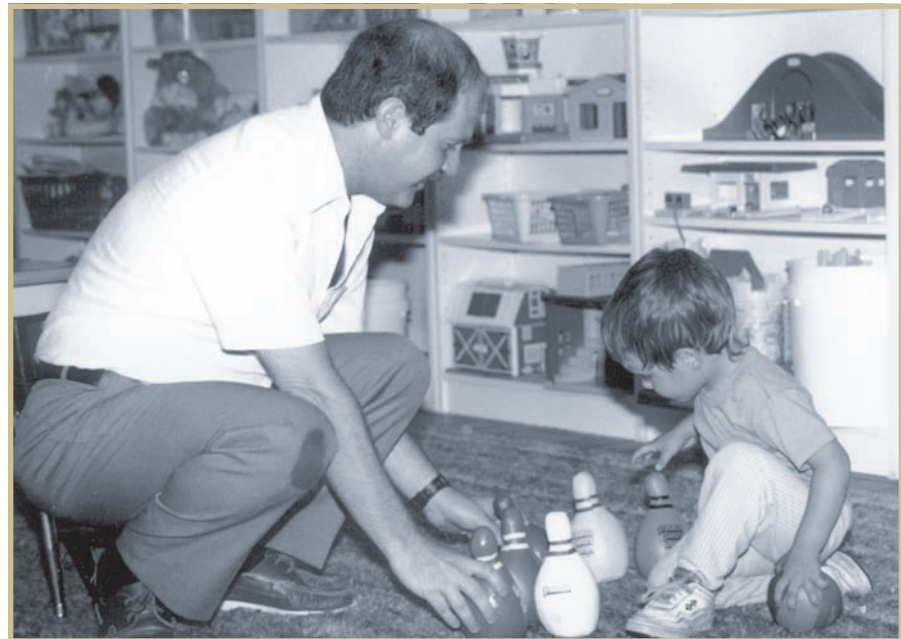
FIGURE 9 —Most public school districts and many private schools employ occupational therapy workers. These occupational therapy workers provide students with therapeutic intervention to become as independent as possible in the school setting so that they'll be able to achieve the best learning ability possible.

Elementary school children usually benefit most from occupational therapy because of the rapid developmental changes that take place during this young age. Occupational therapy professionals work with students who have a range of disabilities, including the following: