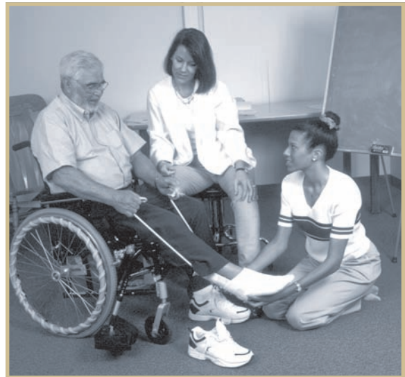
FIGURE 3 —Occupational therapy often includes adapting, or changing, a task to help the patient achieve maximum independent function.

Occupational therapy may also include adapting a task or an environment to gain the highest degree of independence and the greatest quality of life for the patient. For example, an occupational therapy professional might suggest the use of a dressing stick for someone who is unable to dress independently due to limitations in movement (Figure 3). An occupational therapist might also recommend the use of a transfer board for someone who has difficulty moving from a chair to a bed.