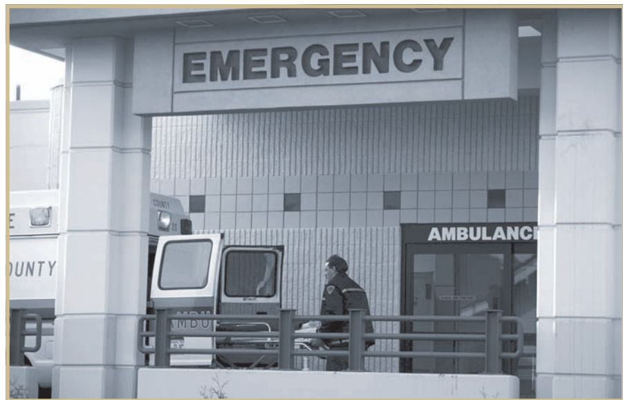
FIGURE 6—Occupational therapy aides are employed in a variety of settings, including general and specialty hospitals.

When selecting where you would like to work, you'll want to consider which age group you're most gifted to work with—children, teens, middle-aged people, the elderly, or a blend of age groups. You'll also want to explore whether you want to help individuals who are recovering from severe to minor physical, developmental, or emotional disabilities. Let's examine some of the settings where occupational therapy aides can work.