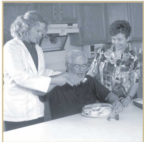
FIGURE 2 —Self-care tasks can include grooming, eating, toileting, and mobility.

Occupational therapy also uses activities that patients perform in order to meet their need to be productive individuals. These work activities , or productive activities , fall into four general categories: (1) home management, (2) care of others, (3) educational activities, and (4) vocational activities. Work activities may include—but aren't limited to—meal preparation and cleanup, shopping, money management, work or job performance, retirement planning, going to school, and caring for a family member.